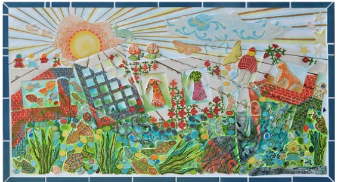
Aquadelirium, ceramic tiles, 50"x30", "...is about transformation from dream to reality, from ruin to life."